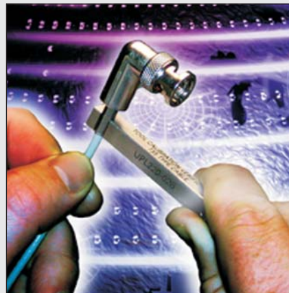
Figure 6 . Installation tools include calibration devices to verify that the connectors were installed according to the manufacturer's specifications.

viding both assembly and inspection tools (see Figures 5 and 6), offering installer certification and maintaining mature ongoing installer training programs.