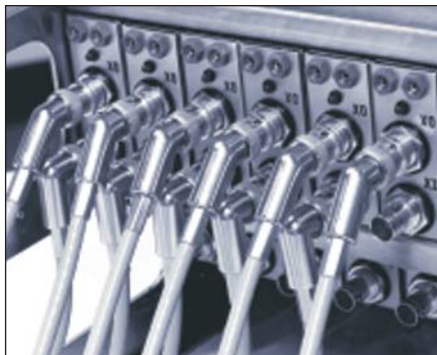
Figure 4 . 90-degree and 45-degree angled connectors help route cables away from the box in an orderly manner.

Network equipment connectivity can take up a lot of space, particularly when it is DS3—central office, outside plant, enterprise wiring. This line type is coaxial and the braid-