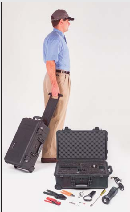
Figure 5 . High quality, reliable field installation of connectors requires a set of the manufacturer's installation tools, plus training in their proper use.

When installers complete their work and turn over their job site to an inspector for quality and conformance inspection prior to activating that portion of the network, several