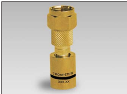
Figure 2 · An improved F connector with captive center conductor and gold plating.

Another issue related to “thinking upstream” that is often overlooked has to do with the physical working condi-