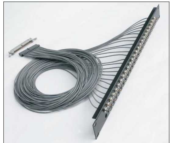
Figure 1 · This “octopus” assembly takes signals from a p.c. board multipin connector at one end and splits them into multiple coax connectors.

Higher data rates need better answers, even with forward error correction coding in place to “solve” network performance problems by retransmitting corrupted information.